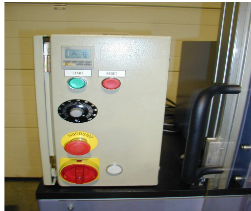
Pict. 4 : Elektrical desk with push buttons: - main switch with indication light - emergency stop - rotary button for frequency ajdustment - start- and stop button - adjustable timer with LCD-display (upper side)