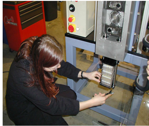
Pict. 2 : a package of products is also put at the bottom.