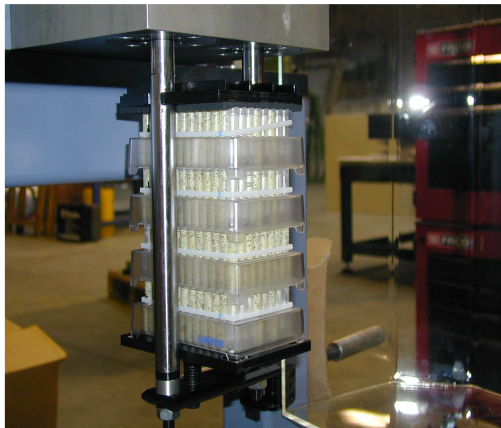
Pict. 3 : detail of products, shaken perfectly linear (test tubes containing agricultural seeds) (amplitude 4cm – frequencu adjustable from 0 to 30 Hz).