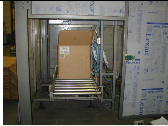
C48 Case (completely formed) leaving the machine