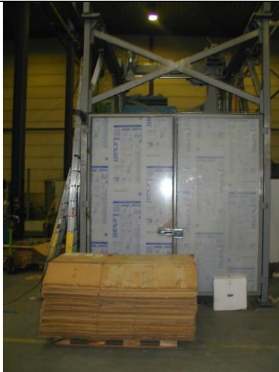
Stack of plano C48 cases