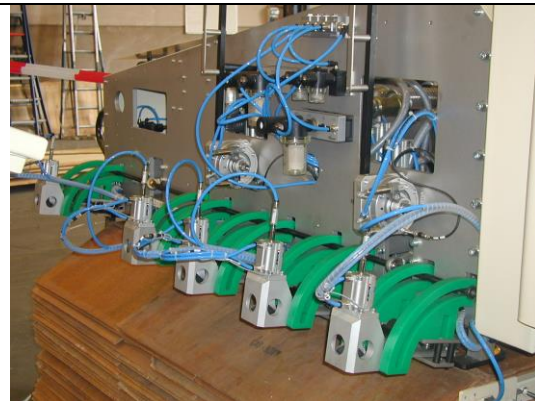
The manipulator takes up the top C48 case from the stack