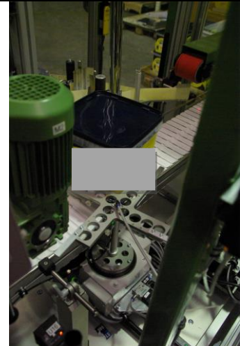
Turning station (turning buckets 90°)