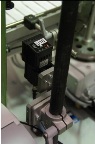
Option : a vision system checks presence of label, or reads label information (Track & trace)