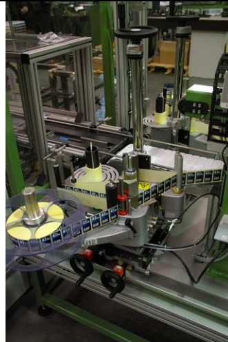
Position of each label unit is adjustable