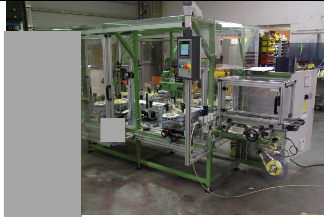
Global view of the machine